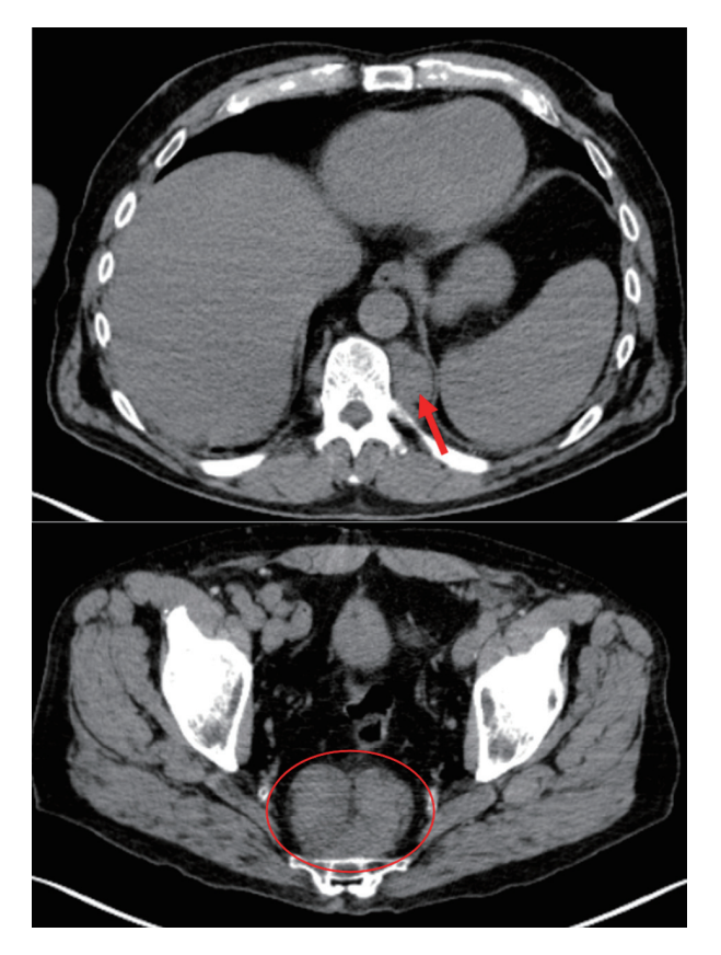
Figure 1. PET-CT images revealing a paraspinal mass at the level of T11 measuring 3.7 \times 2.4 cm with SUV 2.7 (arrow) and the biopsy site presacral nodule measuring 7.5 \times 5 cm with SUV 3.0 (circle). PET-CT: positron emission tomography-computed tomography; SUV: standard-ized uptake value.

of the presacral mass was performed and identified trilineage hematopoietic cells supporting a diagnosis of NHS-EMH (Fig. 2a, b). The specimen was cellular with a normal myeloid to erythroid ratio. The predominant myeloid population stained for myeloperoxidase and demonstrated full maturation. Erythropoiesis was confirmed by the presence of glycophorin-A. Megakaryocytes were identified by CD61 and did not show overt dysplasia. Malignant melanoma was excluded by morphology and absence of S-100 and melan-A staining. Peripheral blood counts were normal and therefore a biopsy of the bone marrow was not performed. Genomic testing for mutations commonly associated with myeloproliferative neoplasms ( JAK2 , MPL , and BCR-ABL1 ) was negative.