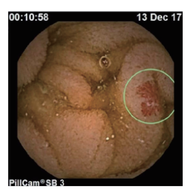
Figure 2. Capsule endoscopy revealed angiodysplasia at the proximal part of the small bowel.

Other comorbidities include asthma and longstanding type 2 diabetes with associated painful neuropathy, precluding the use of thalidomide. The multitude of hospital appointments and procedures had a significant negative impact on his career and quality of life, though he managed to remain in full-time employment.