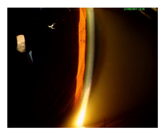
Figure 2. Slit lamp examination of eye showing KF ring.

the presence of Kayser-Fleischer rings (Fig. 1, 2), which are brownish rings that represent fine pigmented granular deposits of copper in Descemet's membrane in the cornea. Bone marrow biopsy showed cellularity of less than 5% (Fig. 3). Chromosomal breakage study did not show increased chromosomal fragility with mitomycin-C. He was diagnosed as a case of Wilson's disease with very severe aplastic anemia and was treated with zinc sulphate 50 mg twice daily along with supportive treatment for cytopenias.