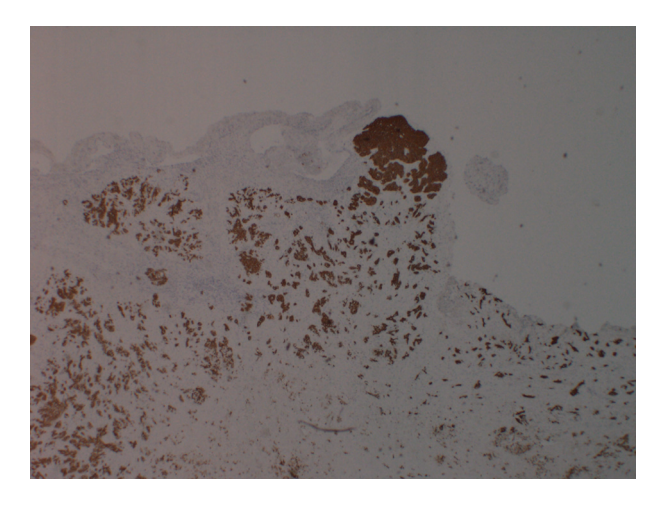
Figure 4. Tumor thrombus staining positive for cytokeratin AE1/AE3.

Tumor thrombus is a rare complication of solid cancers, mainly renal cell carcinoma, Wilm's tumor, testicular carcinoma, adrenal cortical carcinoma and hepatocellular carcinoma. Little is known about tumor thrombus to the pulmonary artery from upper urinary tract urothelial carcinoma. In our patient, it is possible that the surgery might have triggered the hematogenous spread given the peri-vascular invasion. While we do not have definite diagnostic criteria to rule out tumor thrombus, it should be in our differential especially in a cancer patient who has failed at least two classes of anticoagulation or progressed in spite of being complaint and/or therapeutic on systemic an-