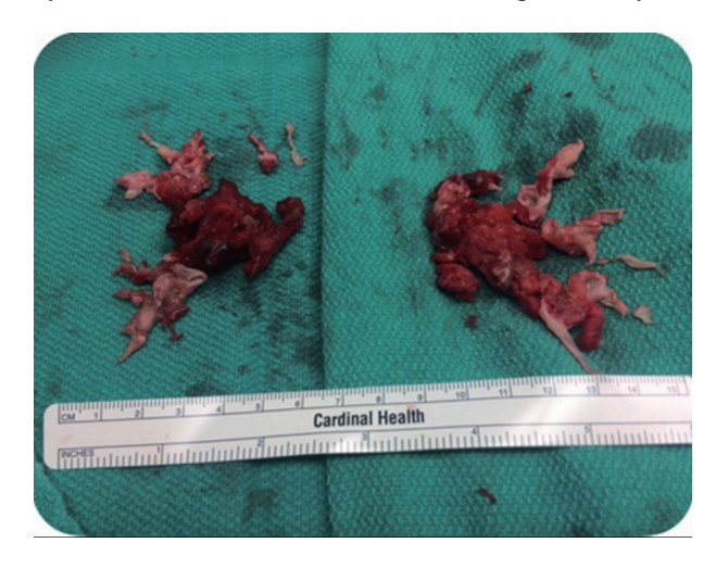
Figure 2. Thrombo-embolectomy specimen.

With the diagnosis of metastatic urothelial carcinoma in the setting of significant cardiac dysfunction and overall deconditioning, patient was started on palliative chemotherapy with weekly gemcitabine along with lifelong anticoagulation with lovenox. Patient had good functional and clinical recovery from the respiratory standpoint after thrombo-embolectomy but his clinical course was then complicated by acute